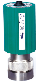
O2X1 galvanic fuel cell oxygen transmitter