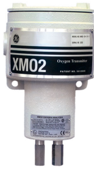
XMO2 thermoparamagnetic oxygen transmitter

The TMO2D provides long-term, hands-off operation with this optional feature. When initiated, the TMO2D controls solenoid valves in the sample system to bring zero and span gases to the transmitter. Then TMO2D software compares the calibration gas readings with factory data to verify proper calibration. If an adjustment is necessary, the TMO2D makes corrections automatically and notifies the user via the front panel display and alarm contacts.