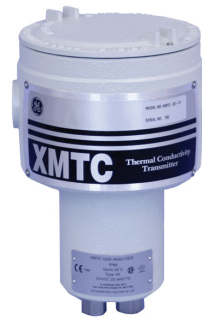
XMTC thermal conductivity gas transmitter